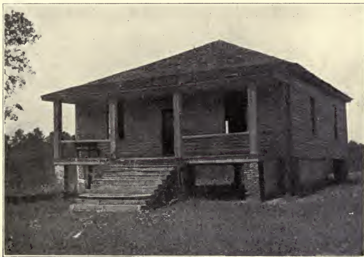
CHAPEL AND SCHOOLHOUSE COLLINSWORTH INSTITUTE, TALBOTTON, GEORGIA